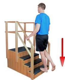
SLOWLY lower heel