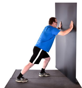
Bend elbows to move closer to the wall to stretch the back leg, keep front knee behind toes