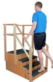
Stand on tip toes