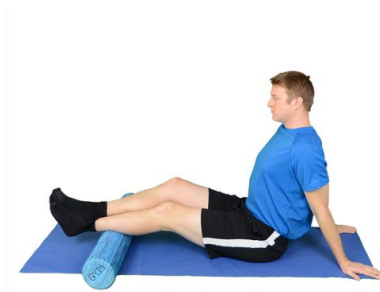
Sit with calf on foam roll