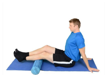
Roll calf up and down roll